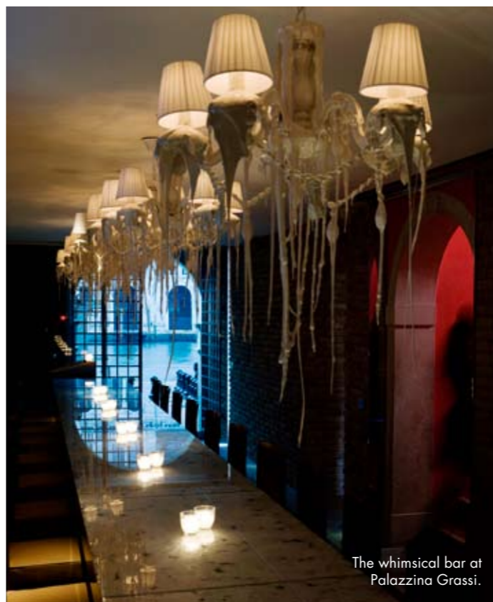
The whimsical bar at Palazzina Grassi.

He's starring in The Tourist , which will be released next year and which also stars Angelina Jolie (whose brood are staying in their own private 16th-century palazzo). The presence of such Hollywood hotties (Brad Pitt is here too, hanging out and taking the kids for gelato) means that actor Paul Bettany can walk about unobserved and as for