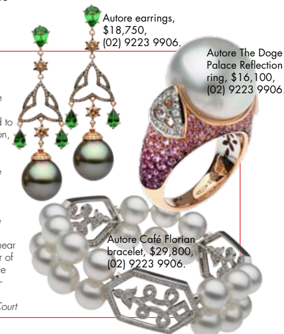
Autore earrings, $18,750, (02) 9223 9906.