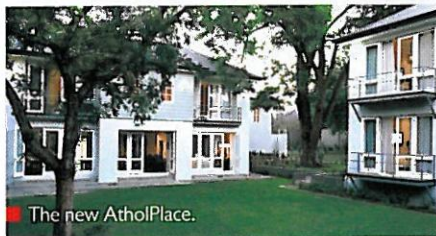
The new AtholPlace.

Just outside the city center, open green spaces abound. One of the best places to enjoy them is at Zoo Lake, where you can take in the views from the terrace of Moyo restaurant (1 Prince of Wales Dr.; 27-11-646-0058; entrées, $8–$14). For a look deep into South Africa's history and human rights abuses, tour Constitution Hill , site of the prison where political activists such as Nelson Mandela and Mahatma Gandhi were held. In Newtown, the city's cultural enclave, the famous Market Theatre stages first-rate plays (56 Margaret Mcingana St.; 27-11-832-1641); next door, the exhibits at Museum