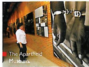
The Apartheid Museum.