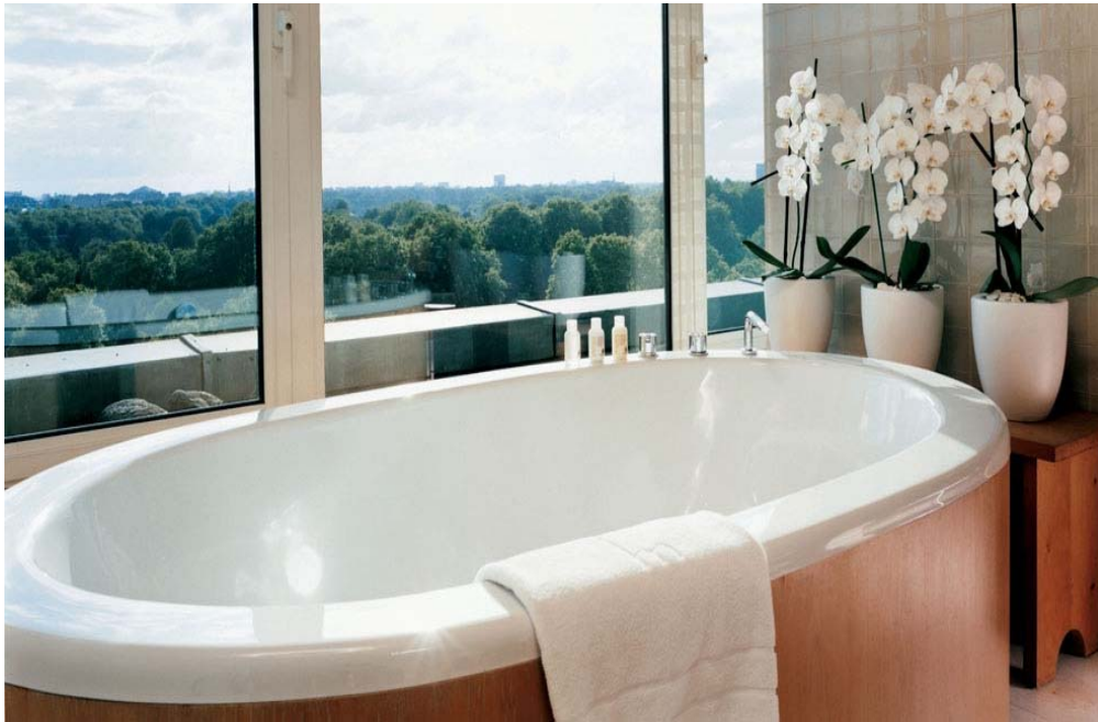
COMO Suite Bath

Overview: Check out the Metropolitan London's classic romance package: book a Rendez-Vous at the Met in time for Valentine's Day, or any weekend interlude. For the chocoholic, get off to a sweet start with a tray of handmade bonbons upon arrival. Then snuggle up with your loved one and enjoy a complimentary film of your choice from the movie channel. Or, why not make one of your own using props from the "Seduction Bedside Box", containing COMO Shambhala "Harmony" Massage Oils, a 20% discount off Coco de Mer goodies, a Luxury Suede and Silk Blindfold by Jimmy Jane , and other items designed to get your imagination going.