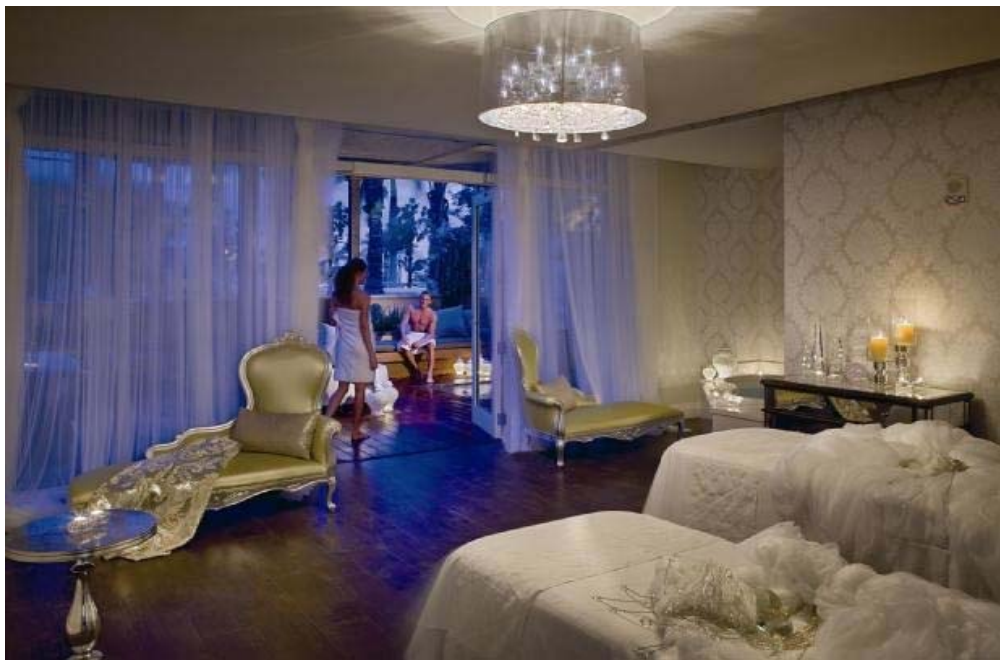
Eau Spa, Ritz Carlton Palm Beach

Overview: For the ultimate romantic spa getaway, book a room at the redesigned Ritz-Carlton, Palm Beach . Tucked away on prime oceanfront property on the southern tip of Palm Beach Island, this five star resort recently completed a $130 million transformation and features breathtaking ocean view suites and the spectacular new 42,000-square-foot Eau Spa . For a special Valentine's Day spa treat, book the Let Us Love You package. This delectable Valentine's Day experience includes an exotic passion fruit cocktail with irresistible chocolates, a Champagne bubble bath in an indoor or outdoor soaking tub in the spacious Couples' Villa, and a 90-minute Iridescent Pearl Shimmering full body massage. There is even a special gift from Cornelia's Lumina Skin Collection to enjoy and take home. Or select a solo treatment in one of the 19 Spa Villas, where you can relax in the Bath Lounge, complete with a ceiling-to-floor shower and heated loungers. Or chill out in the Relaxation Room, where butlers serve refreshments off antique hand-held mirrors.