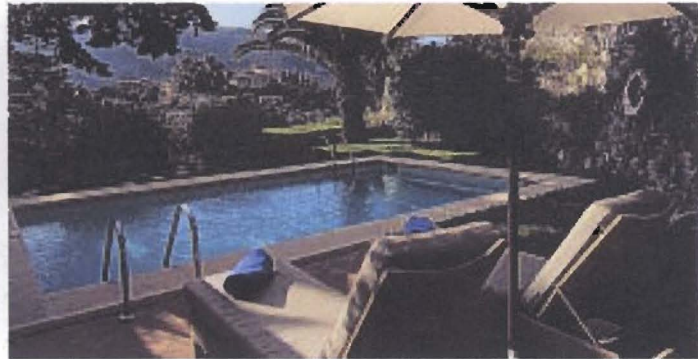
The rich and famous, attracted by Deia's calm, can be found at La Residencia Mallorca