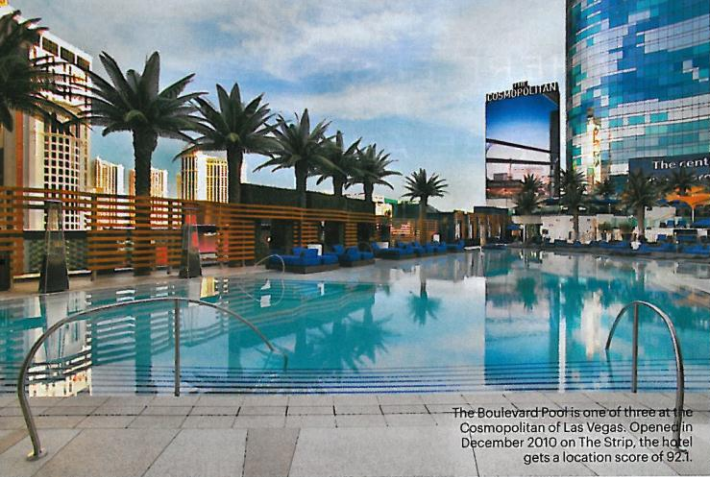
The Boulevard Pool is one of three at the Cosmopolitan of Las Vegas. Opened in December 2010 on The Strip, the hotel gets a location score of 921.