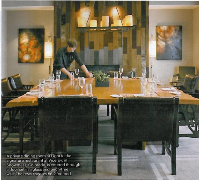
A private dining room at Eight K, the signature restaurant at Viceroy, in Snowmass, Colorado, is entered through a door set in a glass and birch-tree wall. The resort scores 86.2 for food.

Mokara Hotel & Spa, San Antonio 92.0 $91.2 $90.0 $90.9 $95.6 $92.1