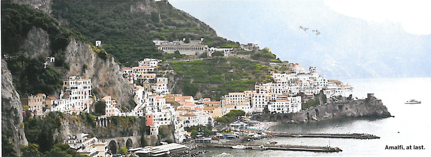
Amalfi, at last.