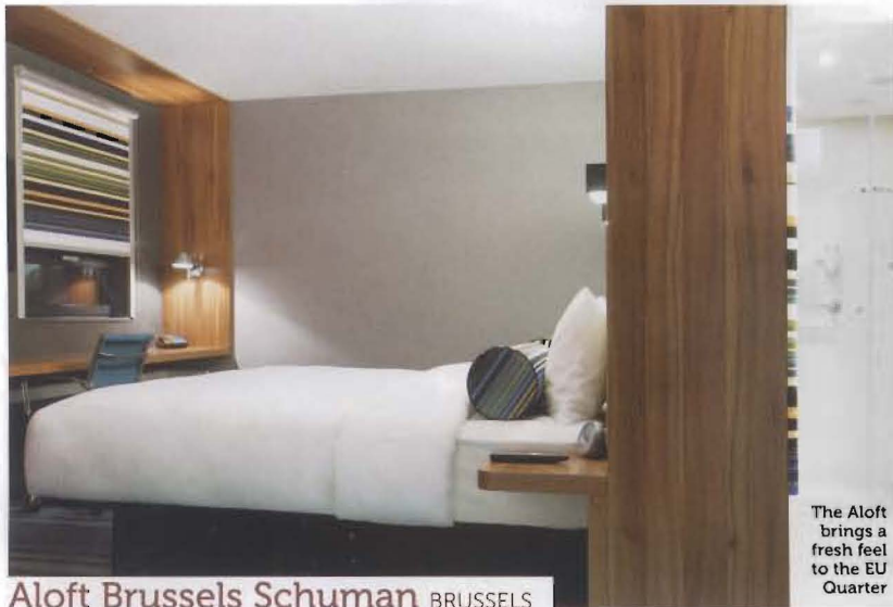
Aloft Brussels Schuman BRUSSELS

We scour the Brussels Airlines network for the best place to lay your head. This month: modern Brussels and traditional Madrid