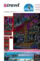
Soak up some French sea air at the elegant Hotel de Toiras in Ile de Ré, with views overlooking St Martin's harbour