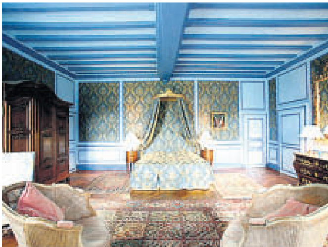
The New York Grill at Tokyo's Park Hyatt, top, offers magnificent views; period style at Château de la Barre; the romantic Villa San Michele in Florence