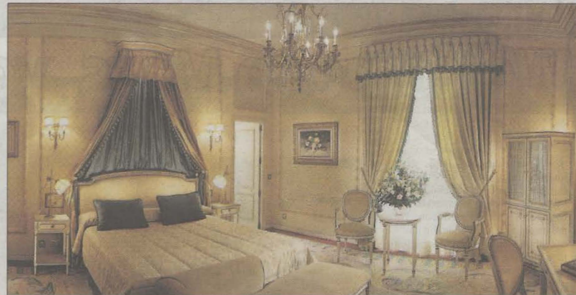
Opulent: The rooms at Madrid's Ritz, which is celebrating its 100th birthday, are dripping with splendour

Stay three nights at the Hotel Ritz Madrid with British Airways from £616 per person departing October 2010. Includes return BA flights from London City and accommodation with breakfast. For reservations visit www.ba.com/madrid or call 0844 493 0758