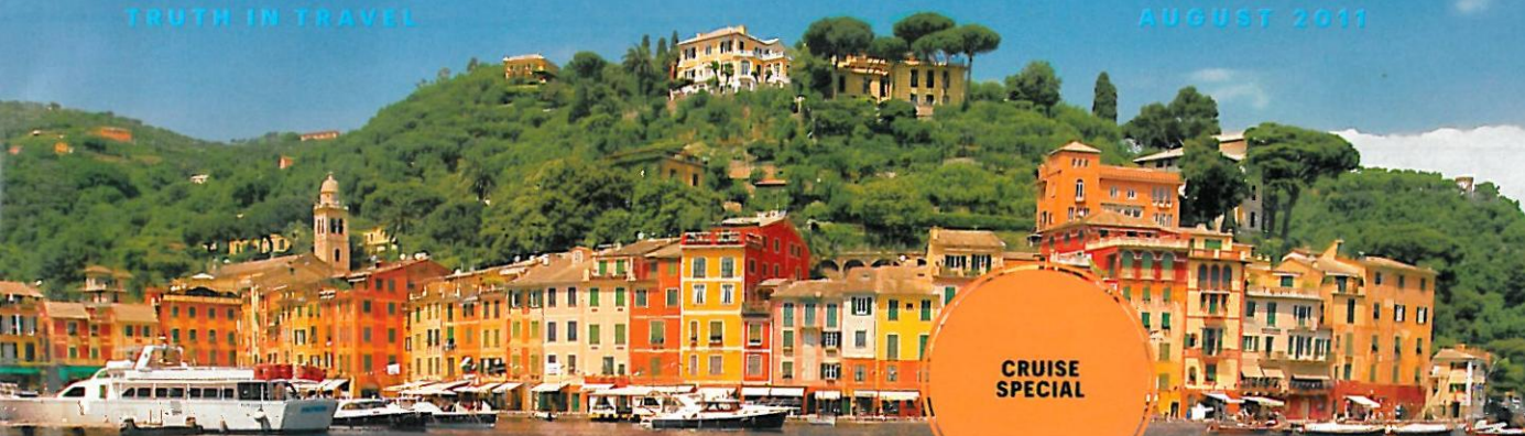
Land ho! Portofino, Italy