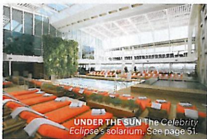
UNDER THE SUN The Celebrity Eclipse 's solarium. See page 51.